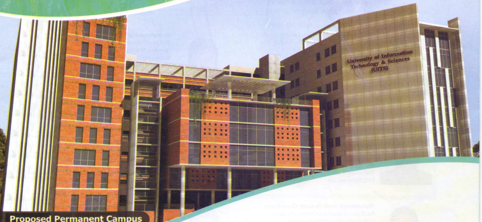
Proposed Permanent Campus