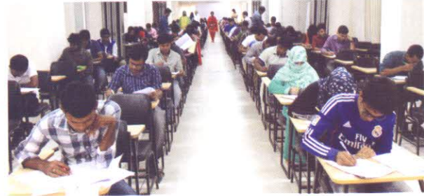
Students are appearing at admission test