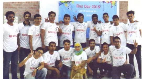
Students are here seen in revelry mood on the occasion of their Rag/Farewell Party.