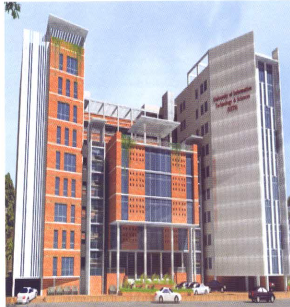
Permanent Campus of UITS ( Under Construction )