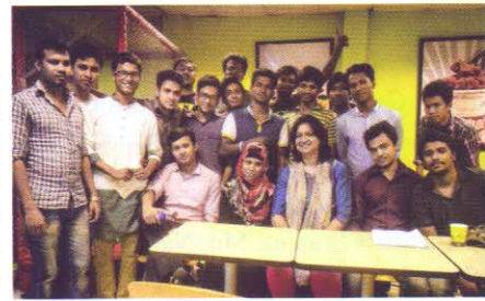
Successful students of the TOP-UP IT program are seen with beaming faces.

A competitive examination for Top-up IT Training and ITES Foundation Skills Training program under the Project of Leveraging ICT for Growth, Employment and Governance was held at UITS between on 5th March, 2016. Forty students from the School of Science and Engineering and School of Business Studies finally qualified for this training program, envisaging the Top-up trainings which include multiple skillsets training such as Net, Java, Mobile application development, Web development, Big data and English and Employability skills to be imparted to students by international trainers for 9-15 hours per week. Overall, Top-Up training will train the trainees for 300 hours for a year with a view to building their skillsets. It should merit attention here that Top-Up IT training program is arranged by the Bangladesh Computer Council under a Memorandum of Understanding signed earlier on 6th February, 2016 between the Bangladesh Computer Council and the UITS, Baridhara, Dhaka-1212, Bangladesh.