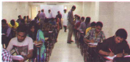
Students are at the Admission Test.