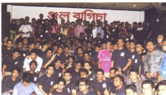
Students of the Departments of EEE and ECE are here seen in frolicking mood, enjoying picnic at the Gulbagicha Entertainment Park of the Gajipur District.

Students' picnic of the Department of Electrical and Electronics Engineering of UITS was held on 19th February 2016 at the Gulbagicha Entertainment Park of Gazipur District.