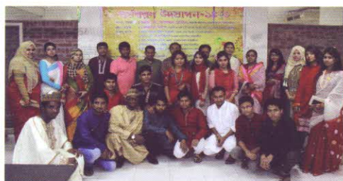
Students and teachers of the Departments of Pharmacy and Social Work are seen enjoying and having fun on the occasion of the Bengali New Year Program observed at the UIITS Campus.