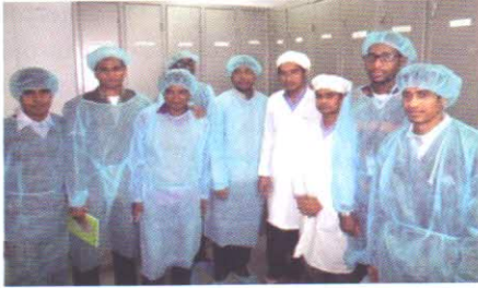
Students of B. Pharm are here seen in lab uniforms, visiting the Bridge Pharma as part of their orientation program in a Pharmaceutical industry.