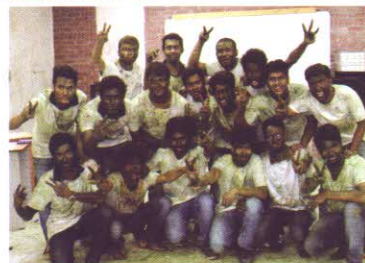
Civil Engineering students are having fun with their besmirched faces on the Rag Day

Rag Day was celebrated on 30th January, 2016 at the UITS Baridhara Campus by the 7th Batch of Civil Engineering students who began their study in the Spring Semester in 2012.