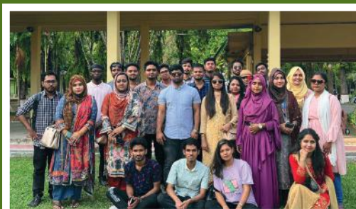
Study Tour, 2022