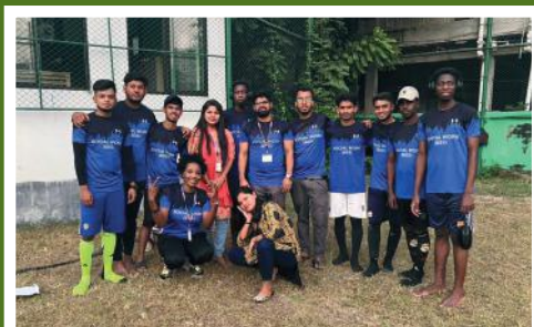
Inter department Football tournament 2021