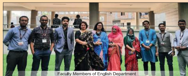
Faculty Members of English Department