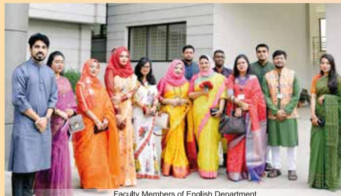
Faculty Members of English Department